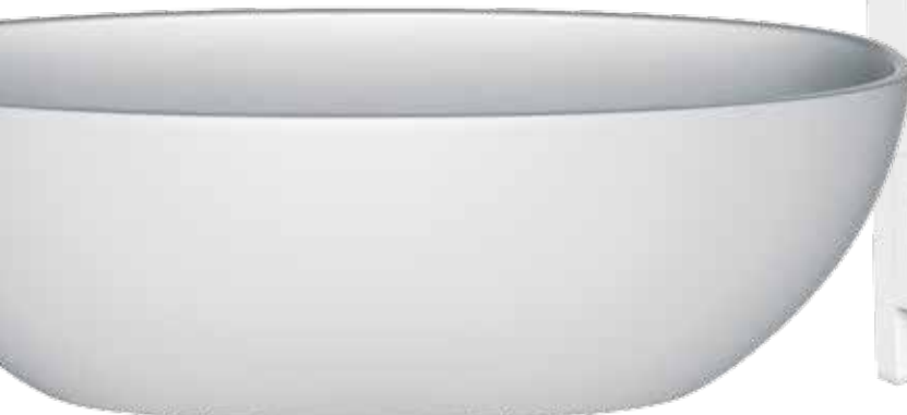
Victoria & Albert, www.vandabaths.com

Who will win? You decide! Cast your vote and enter to win at CanadianHomeTrends.com/win