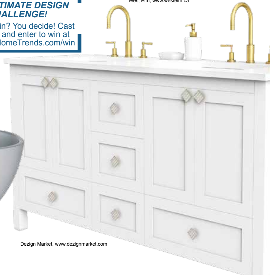
Design Market, www.designmarket.com