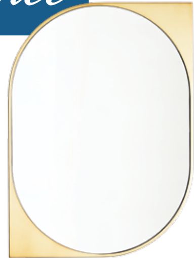
West Elm, www.westelm.ca