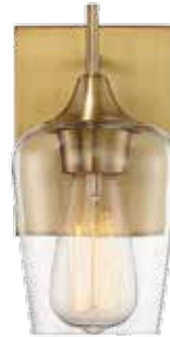
Lite mode, www.litemode.ca

My goal was to create a personal space that balances natural finishes and luxurious touches. Using warm metals combined with plenty of texture and pattern, this look is warm and inviting while still being elegant and sophisticated. It is a timeless combination that results in the perfect place to start and end your day with a positive vibe.