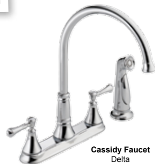
Cassidy Faucet Delta www.deltafaucet.ca