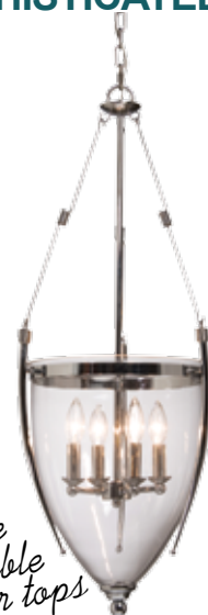
Pendant Light Living Lighting www.livinglighting.com