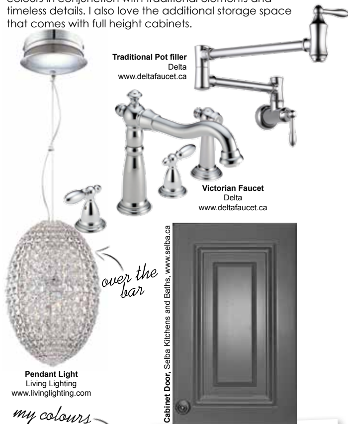
Pendant Light Living Lighting www.livinglighting.com

WHAT I LOVE ABOUT THIS LOOK is the combination of colours in conjunction with traditional elements and timeless details. I also love the additional storage space that comes with full height cabinets.