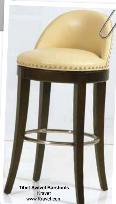
Tibet Swivel Barstools Kravet www.kravet.com