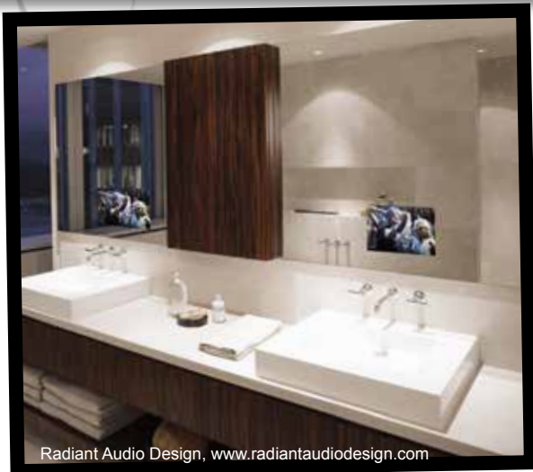
Radiant Audio Design, www.radiantaudiodesign.com

As the year comes to an end, we anxiously await to see what’s in store in design for 2016. We’ve asked Canadian designers to help us predict what will be trendy in the new year.