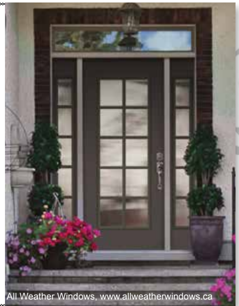
All Weather Windows, www.allweatherwindows.ca

“This is the year of the statement door. Your front door gives visitors their first impression of your home, so it’s important to maintain a style consistent with the inside of your house. The most recent trend in front doors combines strong traditional craftsmanship with bold-coloured contemporary design flair. With an emphasis on size, the most popular doors right now are tall and wide with an expanded glass selection that includes modern leaded and textured glass inserts with mouldings.”